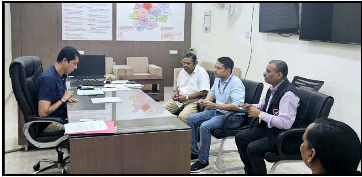
Visit for Nashik, Dhule, Jalgaon and Nandurbar districts of Maharashtra on 17.10.2024 & 18.10.2024