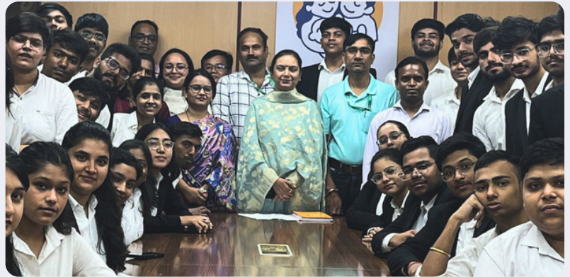
Training of Law students from GIBS, Bengaluru