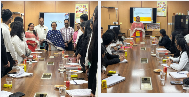
Training of Law Students from JIMS, Noida