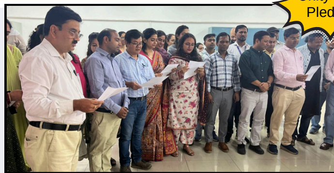
Unity Day Pledge