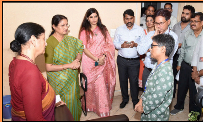
Hon'ble Minister for WCD interacts with employees and officials of CARA