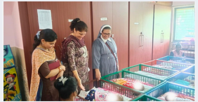
Visit to Amravati, Maharashtra: 04.10.2024 to 05.10.2024