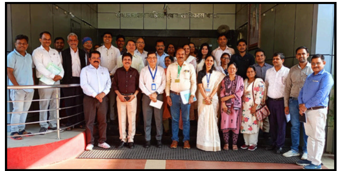
Visit to Bhopal, Madhya Pradesh on 17.10.2024 and 18.10.2024