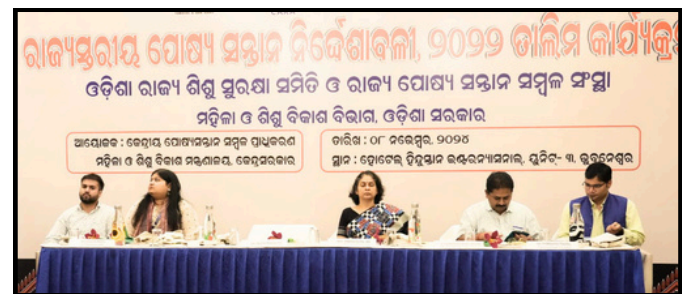
State Orientation in Bhubaneswar Odisha on 11.11.2024