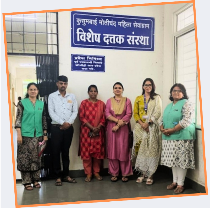
Visit for Pune, Ahmednagar, Solapur, Satara and Sangli districts of Maharashtra on 04.10.2024 and 05.10.2024