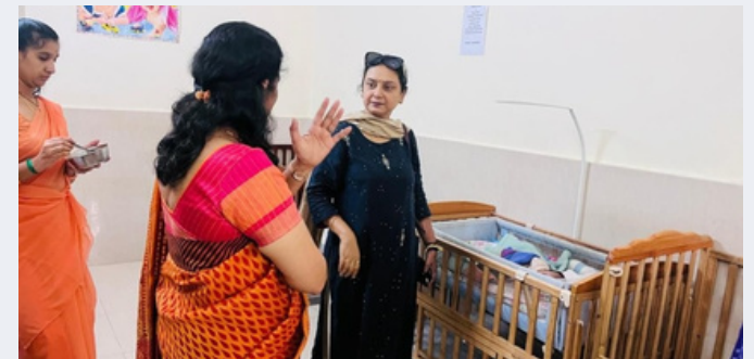
Visit to Bengaluru: 04.10.2024 to 05.10.2024