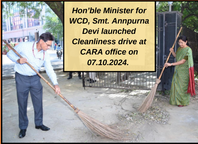
Hon'ble Minister for WCD, Smt. Annpurna Devi launched Cleanliness drive at CARA office on 07.10.2024.